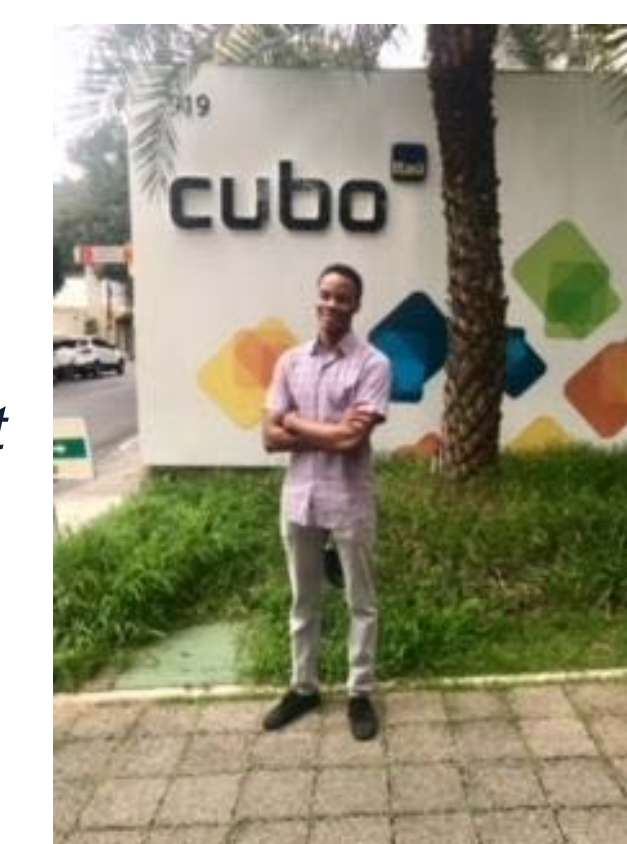
A picture of me at CUBO