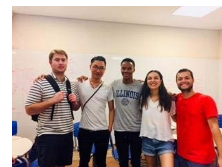
A picture of me and my group working with Brazilian students in order to develop a fintech which promotes financial literacy.

In Brazil I also visited many new technological companies such as Nubank an online banking system and Cubo a place where start ups can go to help get their business and ideas off the ground. Each of the visits helped to highlight the fact that technological advances can play a key role in reducing income inequality in Brazil.