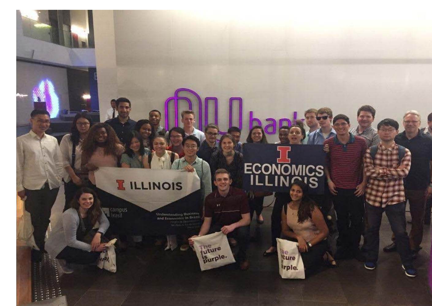
Our Econ 199 group at Nubank