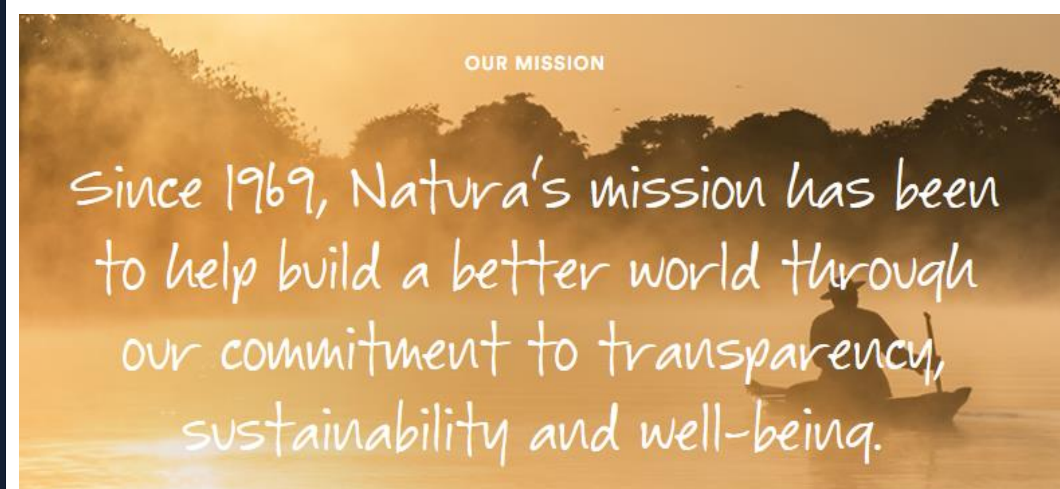
Natura's mission statement