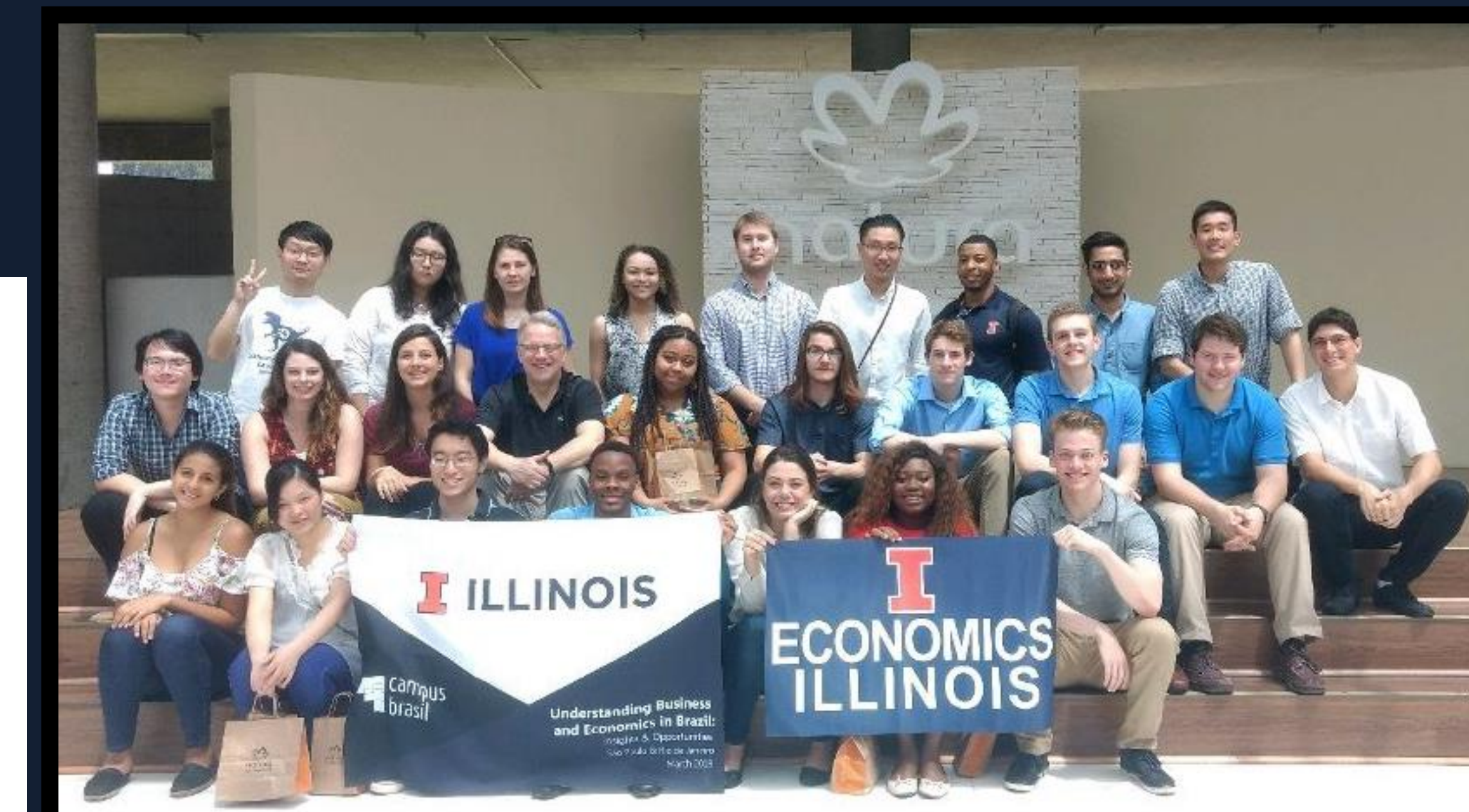
One of the most eye-opening visit during the trip: Natura