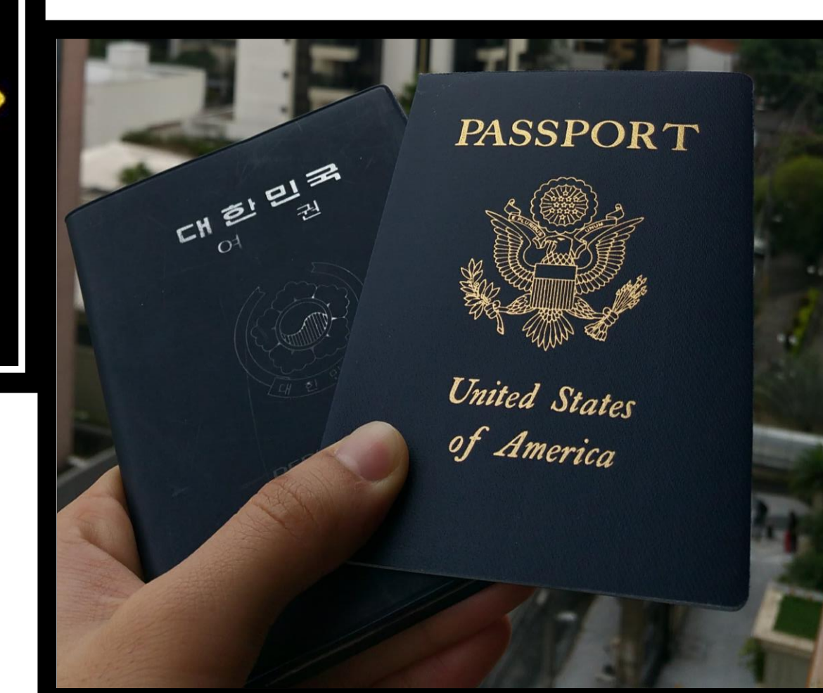
New emergency passport I had to obtain during the trip