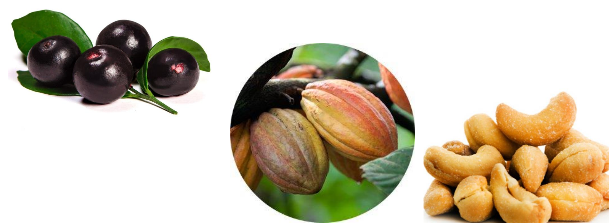
Some of the locally produced raw materials used by Natura Acai, Cacao, and Catechu(from left to right,)