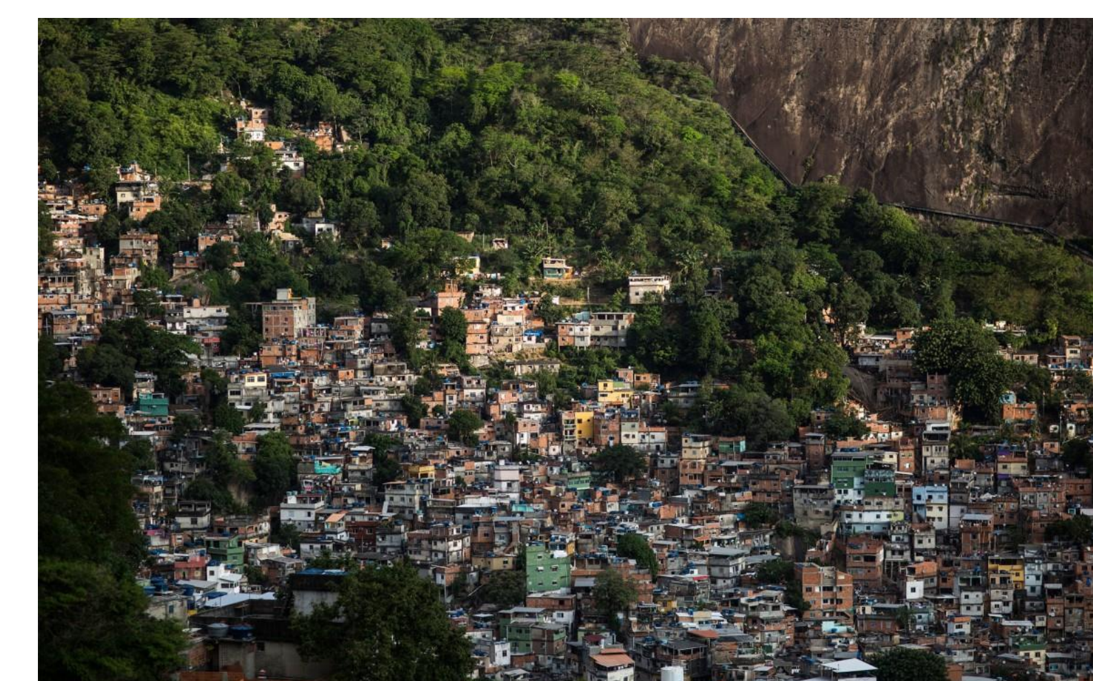
Aerial view of Rocinha from Washington Post

*:From "What is a Favela? Five Things to Know About Rio's So-Called Shantytowns, NBC News (2016)