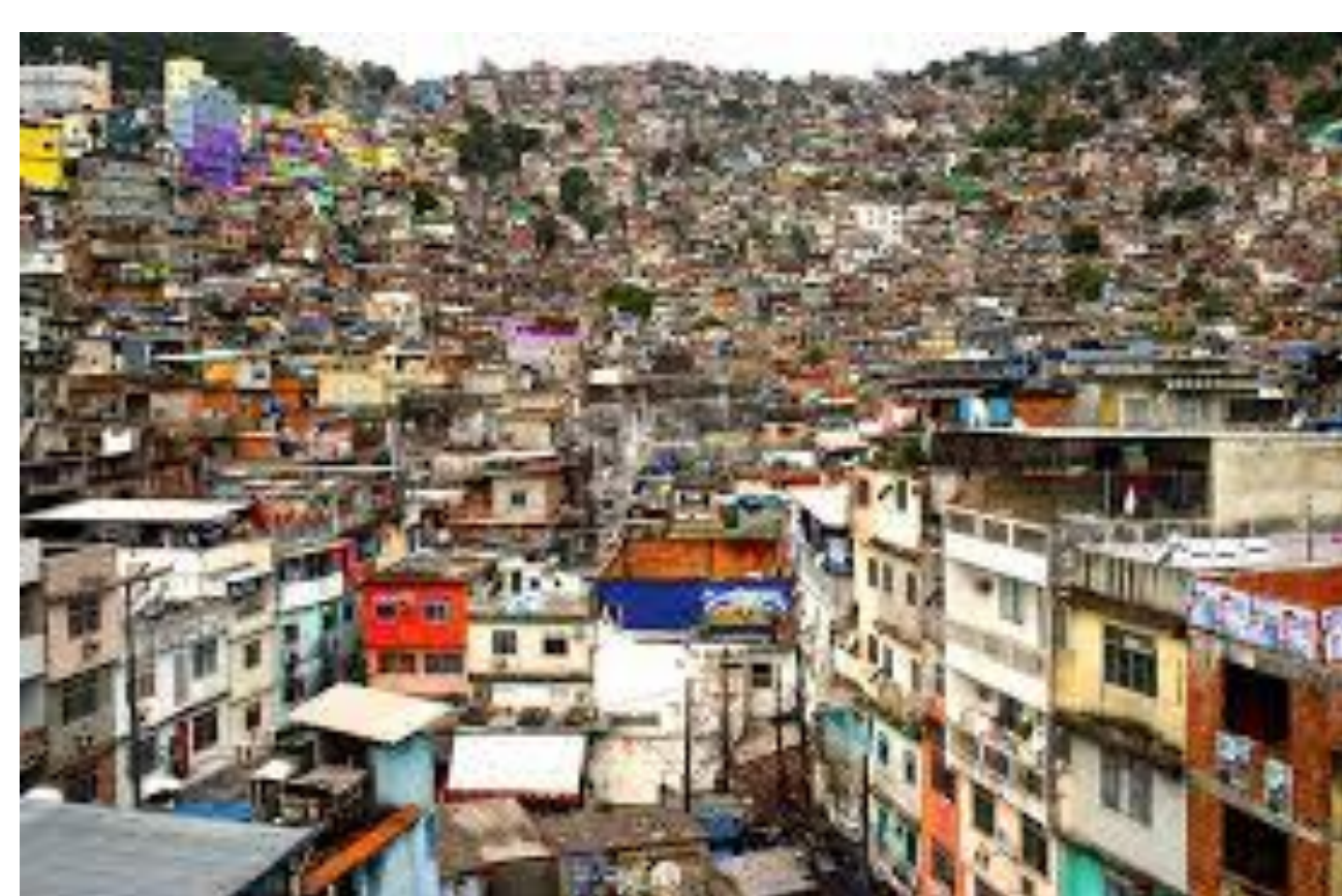
Picture of Rocinha, the largest favela in Brazil

The goal for this study is to determine the effect that improvements in the quality of housing has on economic growth of an area and how that influences the spatial makeup of the city. There are many factors that influence the housing situation and by addressing those issues, it is possible to combat the circumstances that result from them. To clarify, this study is not advocating or suggesting that everyone should live in the same kind of housing. Quality housing refers to living conditions in which there are reliable utilities (electricity, water, etc.), solid and updated infrastructure, better neighborhoods, etc.