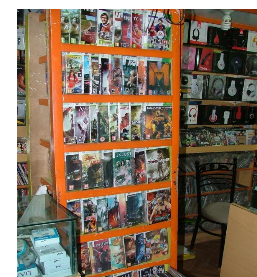
A stall selling Illegal Video Games Copies

Mules often smuggle consoles through one of Brazil's many Borders or can pirate and redistribute video games through means like torrenting. In regard to the PS4, around the time of its release, it could be found on the black market for half the MSRP.