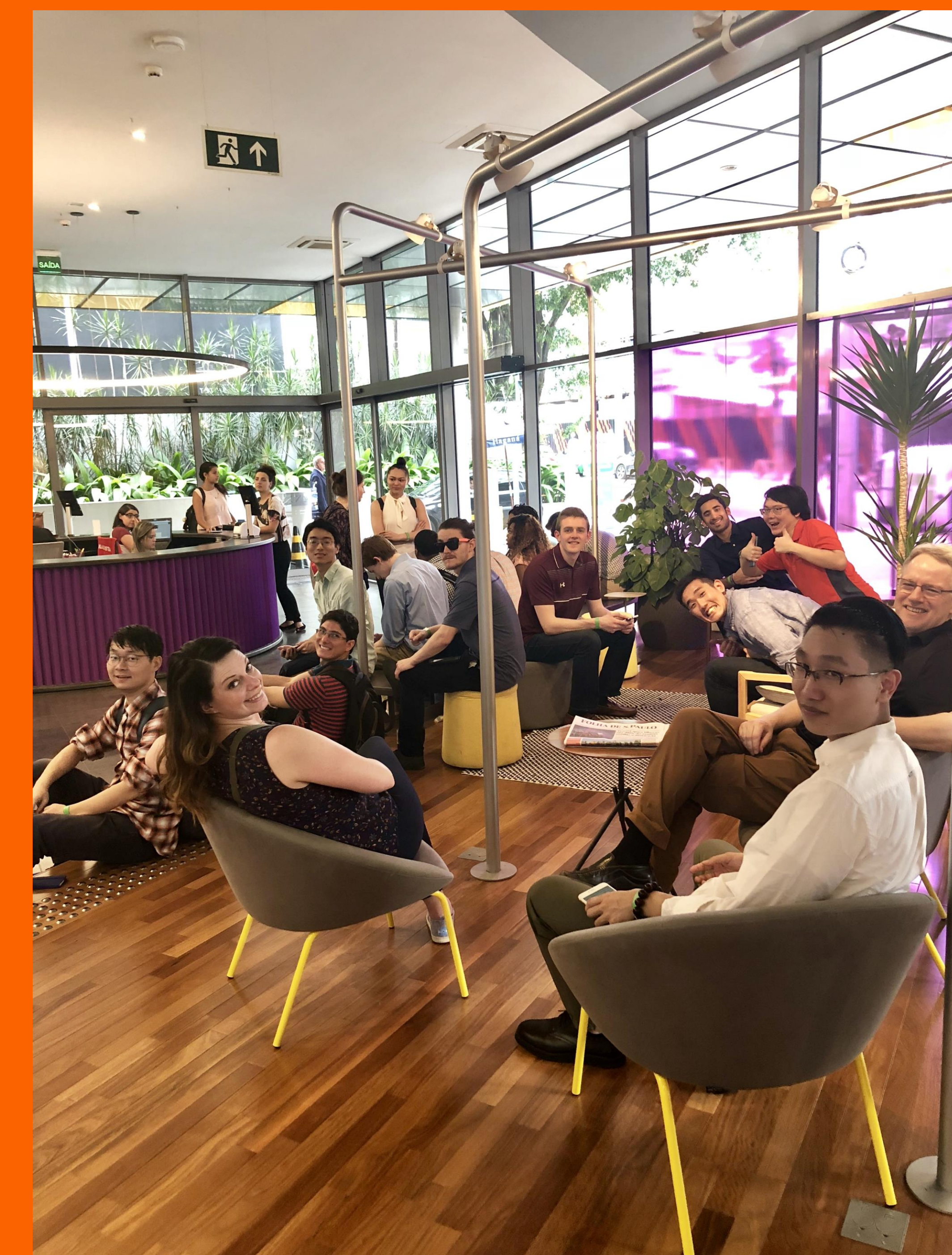
Rest at Nubank's Headquarter